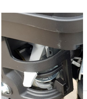
Fig4: Engine Fuel tap lever (black) and choke lever (grey)

Fig3: High pressure outlet : This is where the high-pressure hose connects.