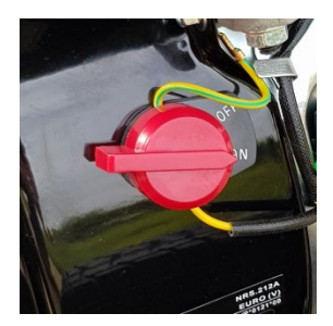
Fig1: Engine on – off switch:

Must be on when starting and switch to off position to stop motor