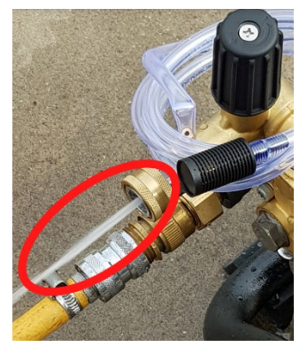
Fig3: High pressure outlet : This is where the high-pressure hose connects.