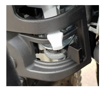
Fig5: Warm start or trouble start position - Engine Fuel tap lever (black) to the right and choke lever (grey) in centre position. Don't forget to move this choke lever immediately to the right (off position) when the engine starts running

Sometimes the engine will not start because of fuel airlock or fuel that has gone off. Please carefully follow the procedure on page 19 if you are struggling to start the engine.