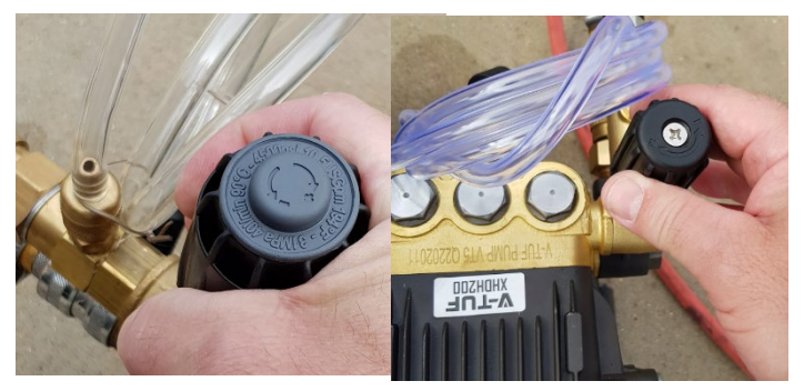
Fig2: Pressure adjustment knob to adjust the pressure on water usage of your machine (these may differ in looks) – turn anticlockwise for a lower pressure and water usage and clockwise for a higher pressure and higher water usage.

When starting the machine please note the Priming /Decompression valve positions (below)