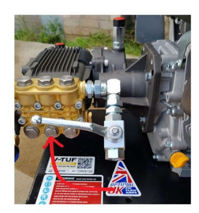
Fig. 1 Fig.2 Fig.3