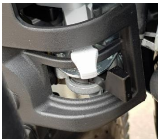
Fig5: Warm start or trouble start position - Engine Fuel tap lever (black) to the right and choke lever (grey) in centre position. Don't forget to move this choke lever immediately to the right (off position) when the engine starts running

The figure shown is the starting position before pulling the pull cord when the engine is cold. Black lever to the right (on position) – this stays in this position throughout the operation; Grey lever to the left (on position) – this choke lever is moved immediately to the right (off position) when the engine starts running.