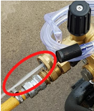
Fig3: High pressure outlet: This is where the high-pressure hose connects.

Must be on when starting and switch to off position to stop motor