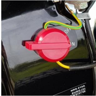
Fig1: Engine on – off switch:

Must be on when starting and switch to off position to stop motor