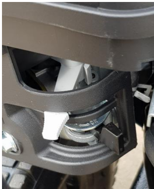
Fig4: Engine Fuel tap lever (black) and choke lever (grey)

The image shows the high-pressure hose disconnected and a jet of water jetting out. This is normally done when priming (getting the air out and water in) the pump when the machine is used on suction. Run the engine until you get a strong stream of water jetting out, then stop the engine and connect on low pressure.